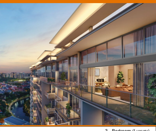
3 - Bedroom (Luxury)